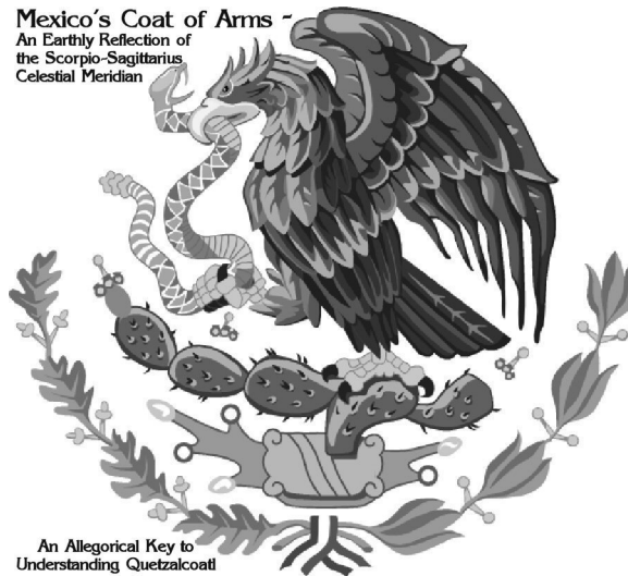
An Allegorical Key to Understanding Quetzalcoatl