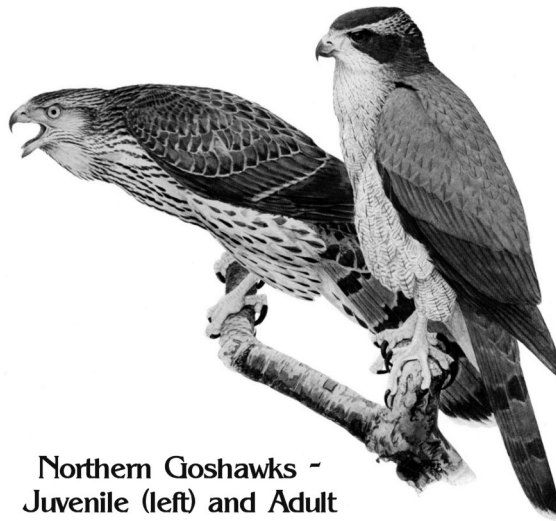
Northern Goshawks - Juvenile (left) and Adult

As mentioned in Book One, the snake-killing falcon originally may have symbolized the Spirit of the coming Son of God to the followers of Seth. Though the initial followers of Seth would not have deified this falcon symbol, subsequent generations sadly did when they tied it to the Nephilim and the worship of Nimrod. However, the falcon symbol may have remained a godly one to certain people who knew