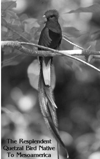
The Resplendent Quetzal Bird Native To Mesoamerica

Could the Hebrew word for feathers - “ebrah” - be one of the root words used to derive the name “Eber?” Is it possible that “eastward” or “of the east” was the primary meaning of Shem’s great grandson Eber’s name, with “feathered” or “winged” being its secondary meaning? If so, then the word “eber” could mean “Bird of the East.” Supporting this theory, there is an uncanny similarity between the root